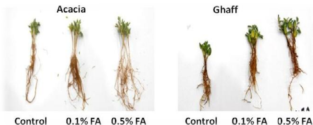
Fig. 2: Relative sizes and densities of Acacia and Ghaff grown with different treatments to seeds

The values sharing a similar letter in a column for each plant species do not differ significantly at 5% probability level.