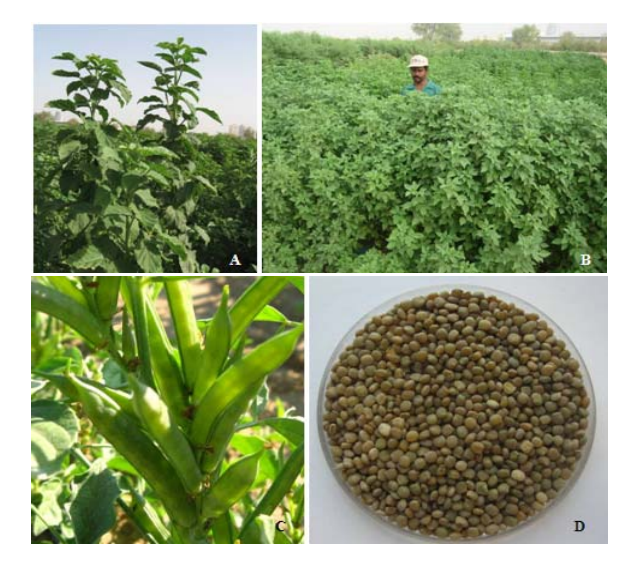
Figure 2. Guar at ICBA research station. (A) Vegetative growth stage; (B) Field trial; (C) Green pods; and (C) Seeds.

item. Highly refined guar gum is used as a stiffener in soft ice cream, instant puddings and whipped cream substitutes, while lower grade guar gum is used in the textile, paper, petroleum, mining, pharmaceutical and cosmetic industries (Undersander et al., 1991).