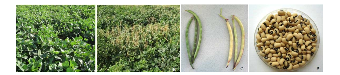
Figure 1. Cowpea at ICBA research station. (A) Vegetative growth stage; (B) Field trial; (C) Seed pods; and (D) Seeds.

Cowpea is an important food legume and a valuable component of the traditional cropping systems in semi-arid tropics covering Asia, Africa, Central and South America. Cowpea has many uses: the young leaves, green pods and green seeds are used as vegetables; and dry seeds are used in various food preparations (Singh et al., 2003) (Figure 1A-D). Cowpea is equally important as a nutritious fodder for livestock. The crude protein content in the grain and leaves ranges from 22 to 30% on a dry weight basis (in comparison, alfalfa has 18 to 20% protein) and from 13 to 17% in the haulms with a high digestibility and low fiber level (Tarawali et al., 1997). Controlled sheep feeding experiments have shown that feeding 200-400 g per day of haulms as a supplement to a basal diet of sorghum stover had 100% higher average live weight gain compared to animals fed with sorghum fodder alone (Singh et al., 2003).