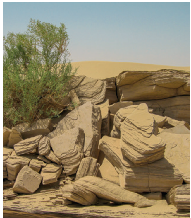
Desert soils are loose and fragile — a view of degraded land in UAE deserts

Sandy desert soils (hot arid climate) are plagued with very low water and nutrient holding capacities, which results in frequent irrigation and nutrient application, high leaching and nutrient losses. Such harsh conditions call for new ways to conserve water, improve soil properties and prevent nutrient losses. One of the best ways is to modify sandy soils with organic and inorganic amendments to improve soil tilth and ultimately improve moisture and nutrient retention, leading to efficient use of water resources and preventing groundwater pollution. At ICBA we have proved through greenhouse and field trials that the addition of suitable quantities of organic and inorganic amendments improved soil qualities, leading to significant water saving and doubling fresh biomass production.