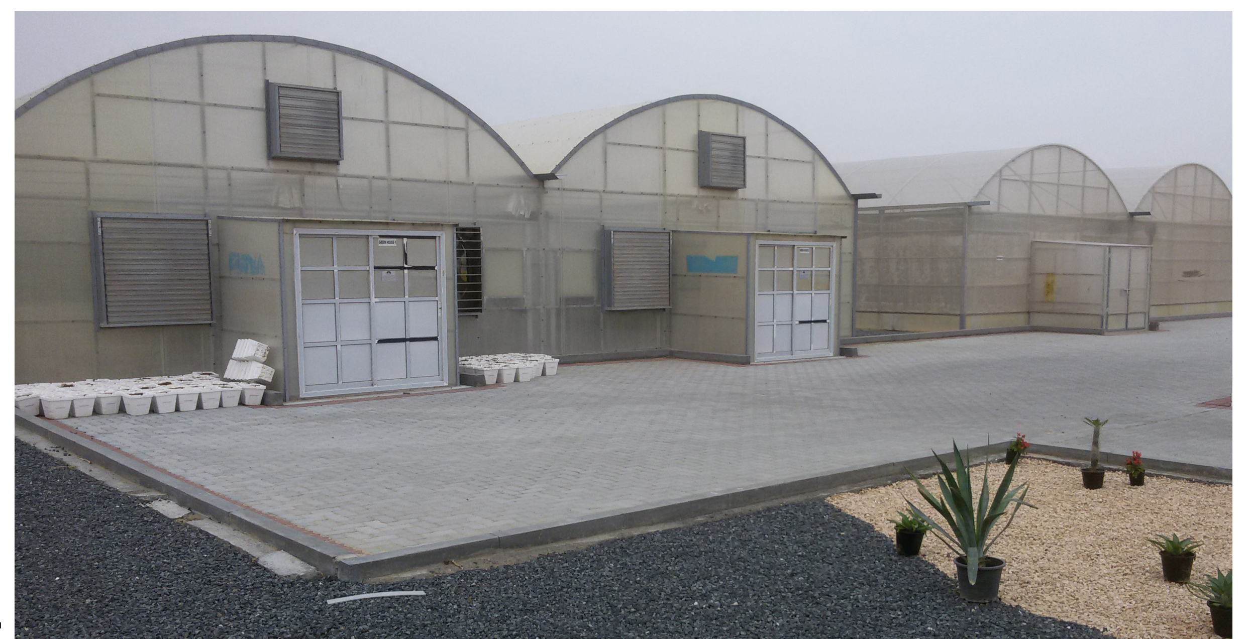
Greenhouse and net house structures at ICBA

The greenhouse and net house area is 560 m 2 each with two spans, each span has a width of 8 m, length of 35 m and height of 5 m (See photo 1). the net house is equipped with a mist system consisting of nozzles with an hourly discharge of 32 l/hr. In order to reduce the temperature and evaporation a shade net was installed above the mist system. The used net is an insect proof net with stitch dimensions equal to 1 x 0.5 mm. While the greenhouse is cooled through fan-pad system and equipped by automatic sun screen system. Both greenhouse and net house contain close drainage system where drainage water is recycled.