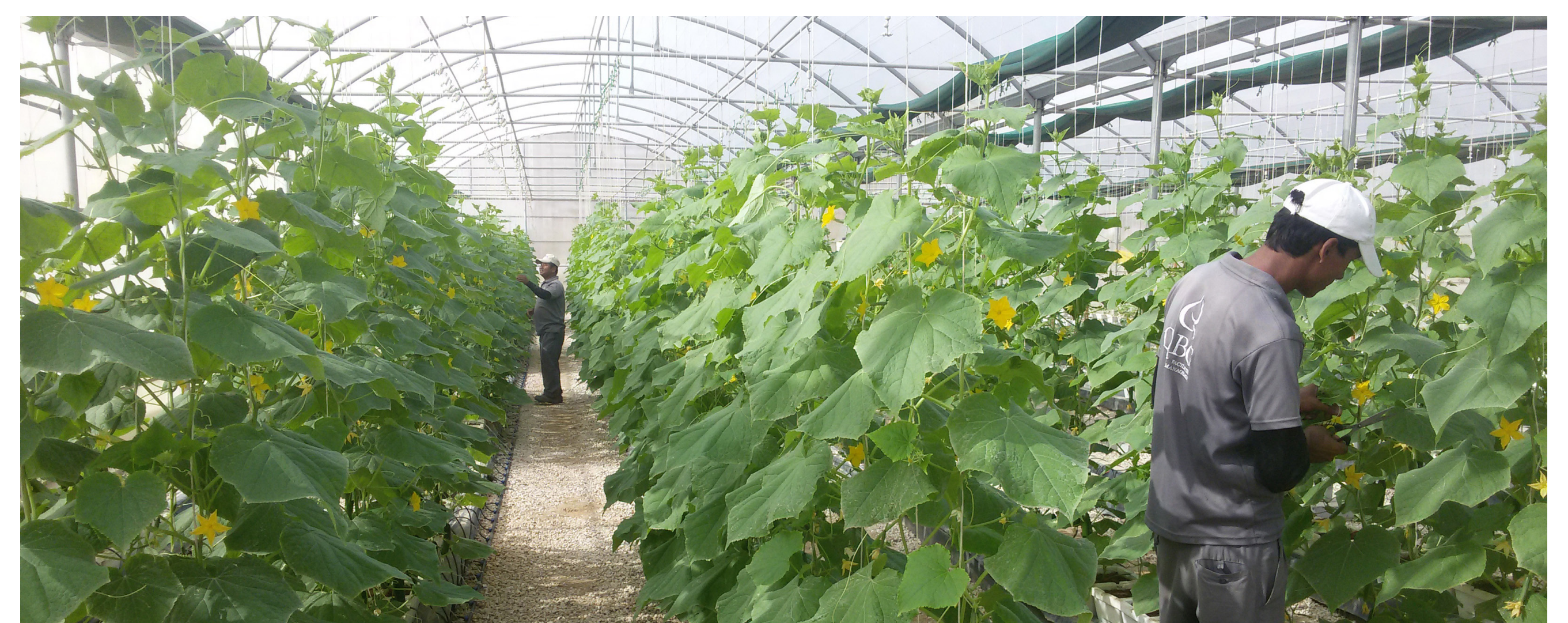
Cucumber grown under net house conditions