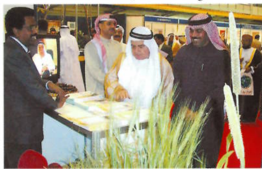
Visitors at ICBA's stall at the International Exhibition on Water and Technology in Dubai

In concert with the international conference, an International Exhibition on Water and Energy Technology was held in Dubai. ICBA participated by presenting an exhibit of its publications and posters.