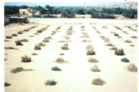
Salt-tolerance screening at ICBA: (left to right) pot studies; lysimeter studies of mangrove species in collaboration with ERWDA; and field studies.